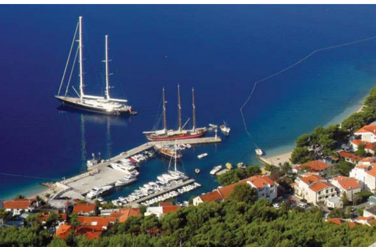
BRELA-SOLINE: 100 berths, of which 60 for members (3)

The County will continue supporting efforts of this kind, mutually connecting neighbouring administrative units aimed to a synergic effect, making the whole much more than a mere sum of its parts."