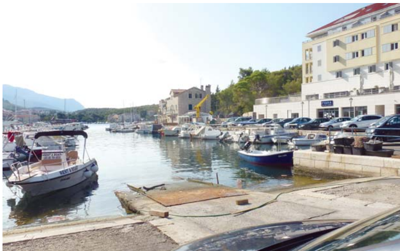
MARKARSKA-ARBUN (11): 220 berths only for members