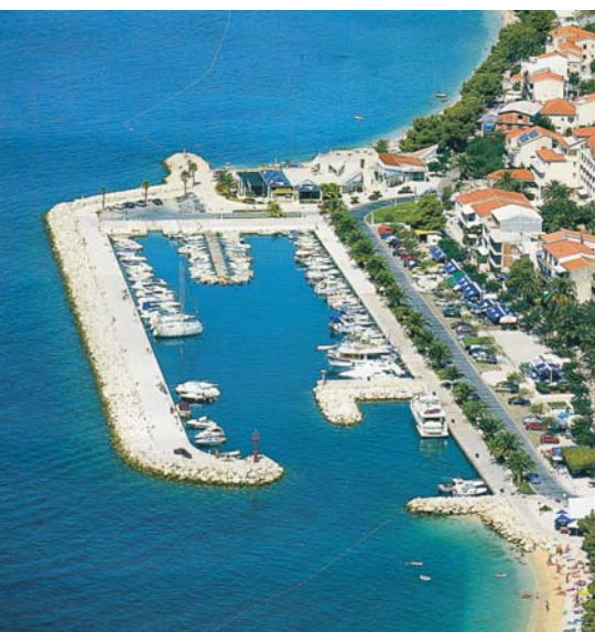
TUČEPI (3): 150 berths, of which 130 for members