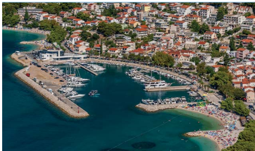
BAŠKA VODA: 200 berths, of which 120 for members (4, 3)