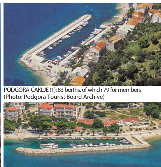
PODGORA-ČAKLJE (1): 83 berths, of which 79 for members