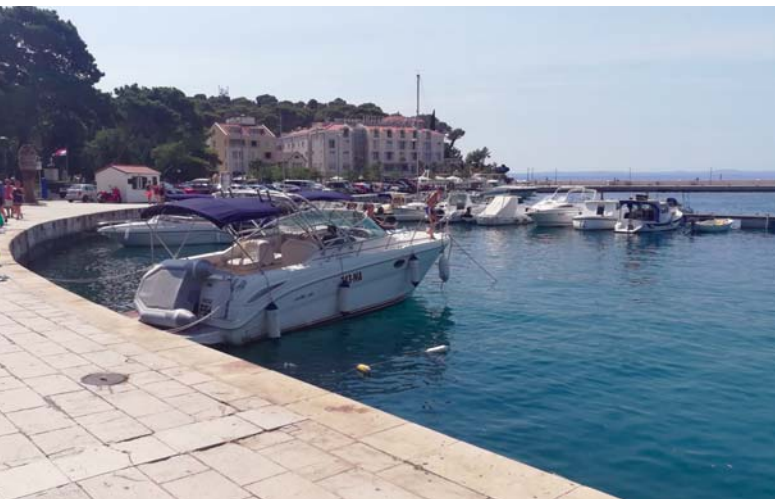
PORT OF MAKARSKA (13): 120 berths, of which 80 for members