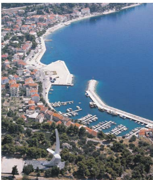
PODGORA-PORAT (2): 213 berths, of which 195 for members