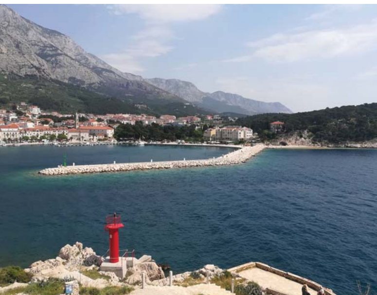
MAKARSKA BREAK WATER 217 m (Investment 4,5 Mio €)